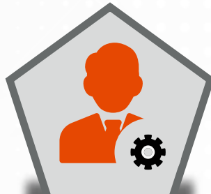
Manage Customer Accounts