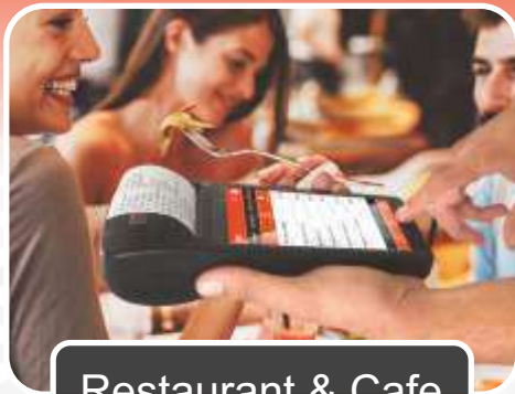
Restaurant & Cafe

A Simple VAT & GST Ready Billing POS System Suitable for all below Industries