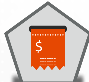
Receipt / Bill Printing